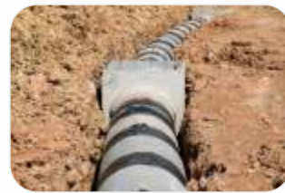
SEWAGE PIPE LINE