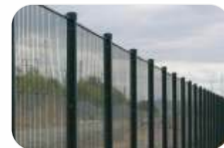
LAYOUT FENCING & DEMARCATION